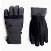
25N UNIFORM GREY