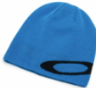
9NB NUCLEAR BLUE