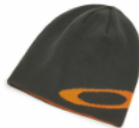
08L NEW DARK BRUSH