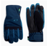
6PP POND BLUE