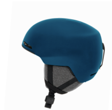
Matte Poseidon 99505Y-6A1 $120 S/M