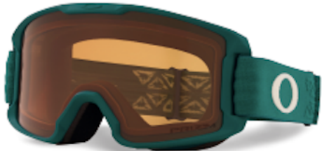
Prizm™ Icon Balsam