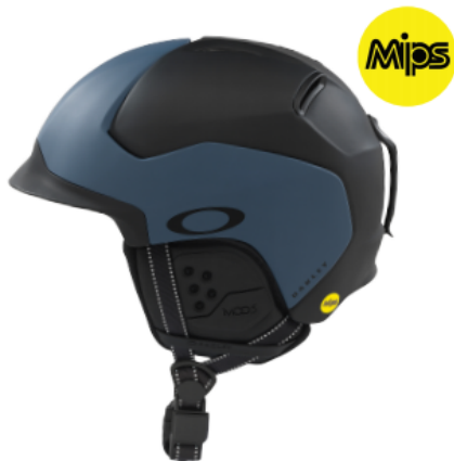
Matte Dark Blue 99430MP-609 $240 (w/MIPS) 99430-609 $200 S/M/L