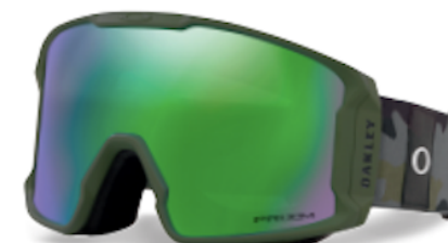
Dark Brush Grey Camo