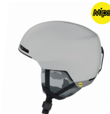
Matte Grey Camo 99505-MP-9A2: S/M/L/XL $160 (w/MIPS) 99505-9A2: S/M/L/XL $120 99505A-9A2: S/M/L $120