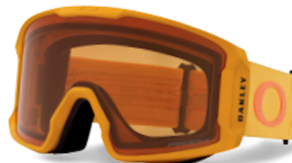
Prizm™ Icon Mustard Orange