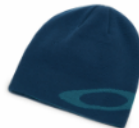
6PP POND BLUE