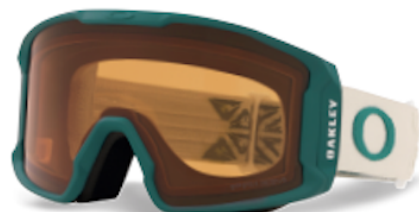
Prizm™ Icon Balsam Grey