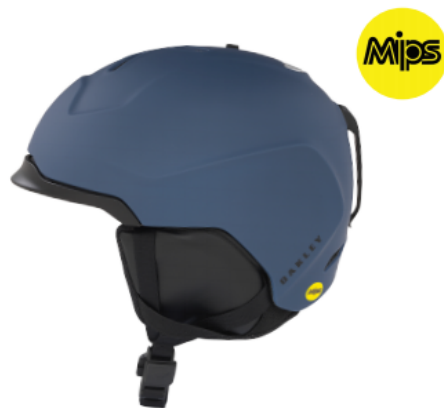
Matte Dark Blue 99474MP-609 $200 (w/MIPS) 99474-609 $160 S/M/L